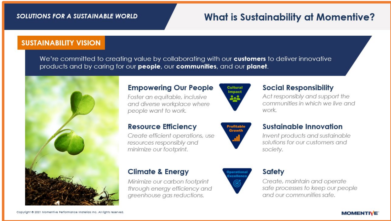
Momentive's Six Most Material Priorities as per the 2020 Materiality Assessment.

The resulting list of material priorities form the foundation of our 2025 Sustainability strategy and are summarized into six categories, shown below. These priorities align with Vision 2025 and are the basis for a broad-based employee awareness campaign that began in late 2020 and is ongoing. They reflect and ensure the highest possible degree of alignment between our sustainability priorities and our public communications of progress.